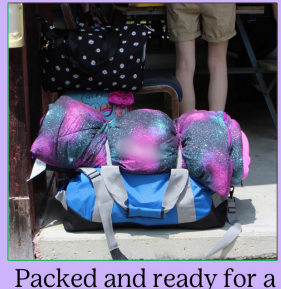
Packed and ready for a week at camp!