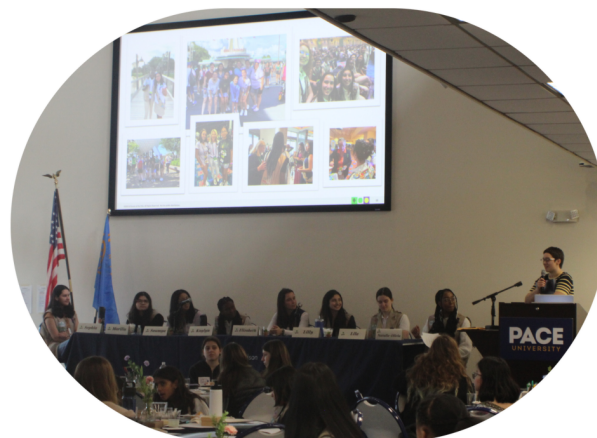
National Convention attendees shared their experiences on a panel.