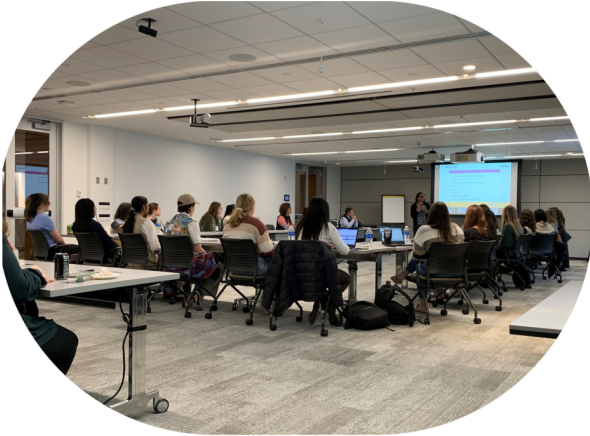
Girl Scouts hear from PepsiCo staff about how STEM plays a key role in the development and production of PepsiCo products.

For the 2023-2024 school year, 16 Senior and Ambassador Girl Scouts participated in the Million Women Mentor Program.