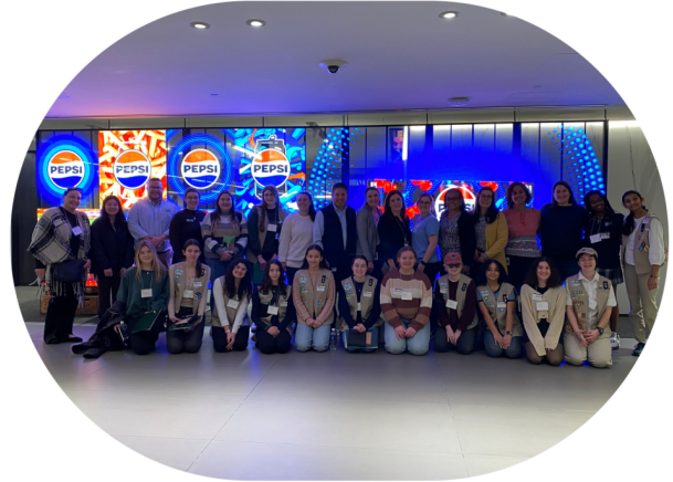
Right: Group photo the 2024 Million Women Mentors Girl Scout class.