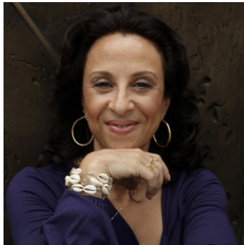
Maria Hinojosa Age: 60 Roots: Mexican