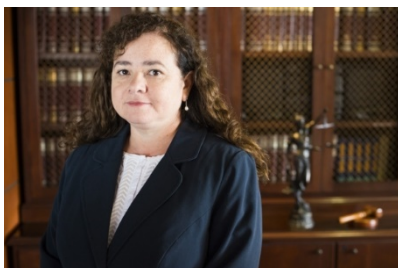
Claudia Paz y Paz Age: 54 Roots: Guatemalan

She is the author of two books and has won dozens of awards, including four Emmys, the John Chancellor Award, the Studs Terkel Community Media Award, two Robert F. Kennedy Awards, the Edward R. Murrow Award from the Overseas Press Club, and the Ruben Salazar Lifetime Achievement Award from the NAHJ. She has been honored with her own day in October by New York City Mayor Bill de Blasio and has been recognized by People En Español as one of the 25 most powerful Latina women.