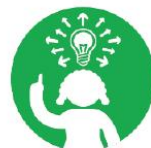
Exhibit community problem-solving skills (57% vs. 28%)

Develop and maintain healthy relationships (60% vs. 43%)