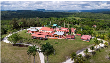
Rumors Resort Hotel San Ignacio (or similar)