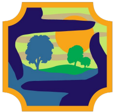
Outdoor Art Master

The following badges will be available to all Ambassador Level Girl Scouts. Senior and Cadette level badges can be added should there be a need.